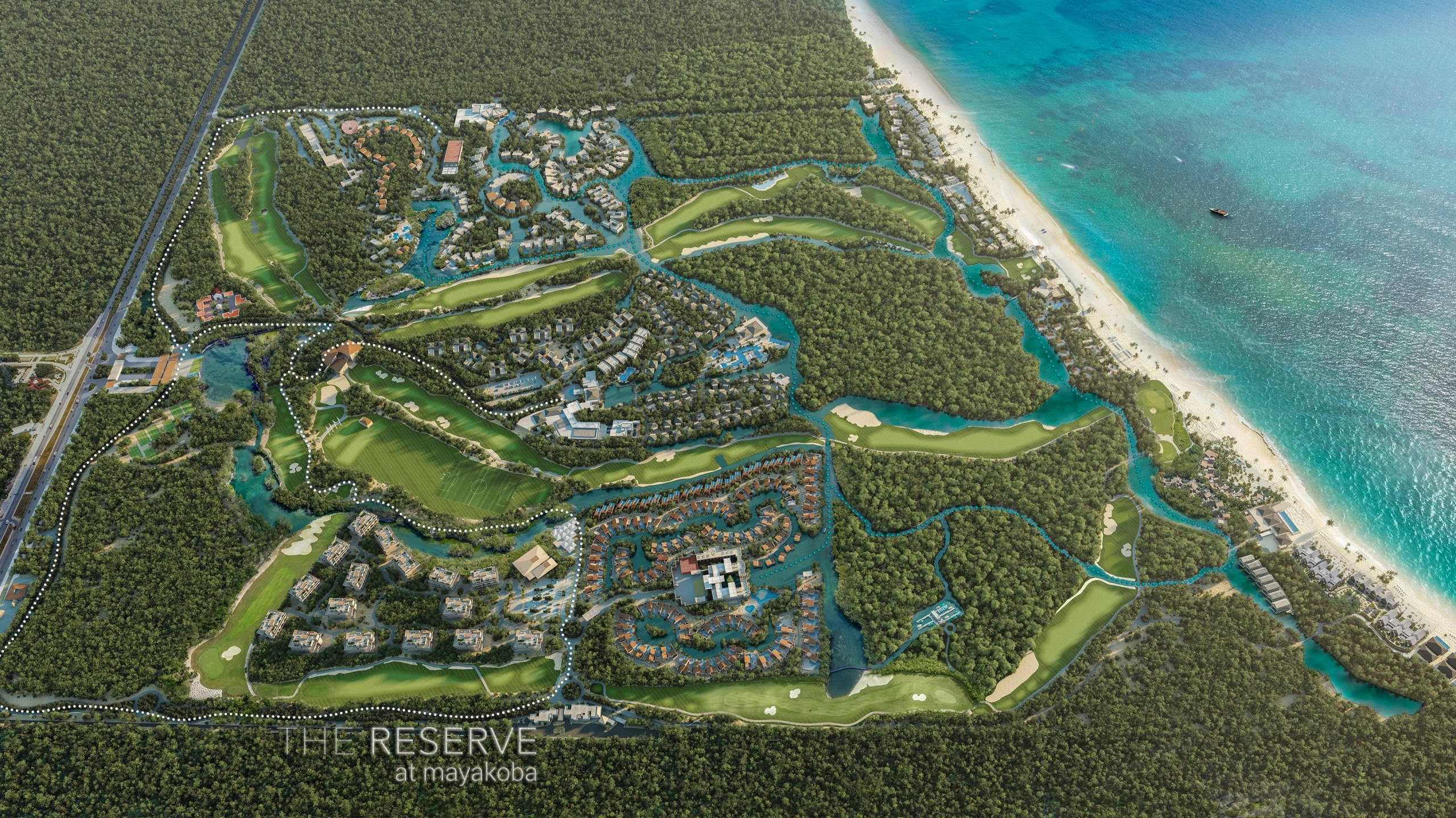
THE RESERVE at mayakoba