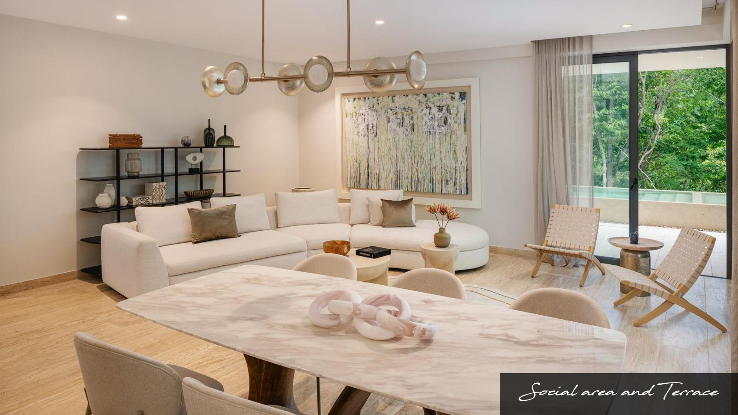
Social area and Terrace