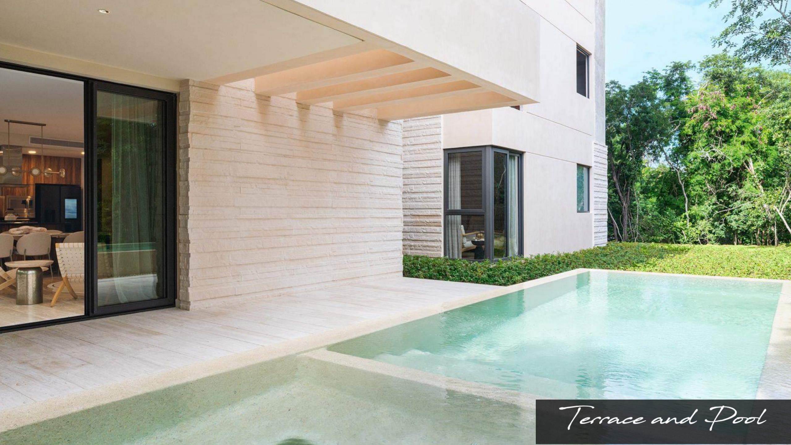
Terrace and Pool